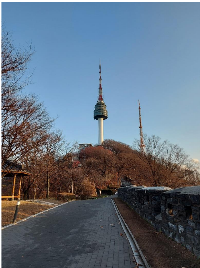
Namsan Tower in the middle of Seoul.